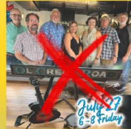
BICENTENNIAL CELEBRATION WEEKEND