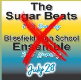
BICENTENNIAL CELEBRATION WEEKEND